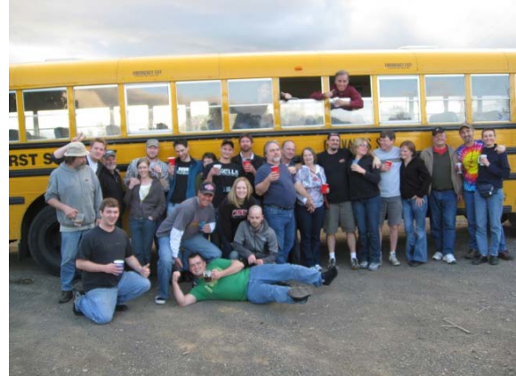
The pub crawl bus and crawlers

Thanks to all who turned out for the crawl and look forward to next year's!